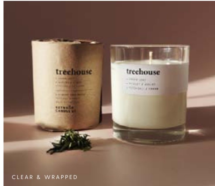
CLEAR &amp; WRAPPED

Our amber candles are crafted and hand-poured at our workshop in Newquay. We use recycled labels and wooden lids which are completely unique. Most candle lids contain plastic or silicone, not ours! Each candle is wrapped in sustainable tissue paper hand packaged into our unique eco boxes creating the perfect gift for the consumer and also a wonderful display in/on your store.